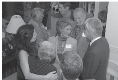
Guests of the soirée.