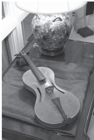
A specially displayed violin.