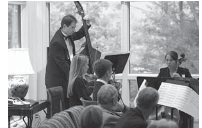
UM students performing the "Krete Suite."